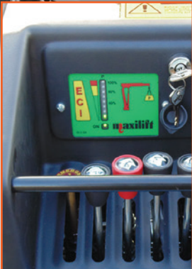
ECI: Electronic Capacity Indicator