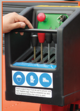
4 function proportional control