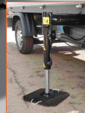
Stabiliser leg & outrigger pad (options)