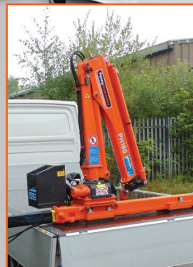
PH180 in stowed position