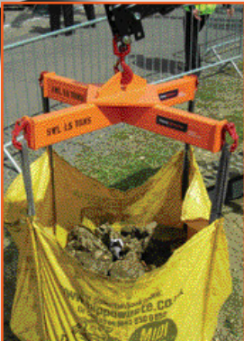
Lifting attachments & accessories