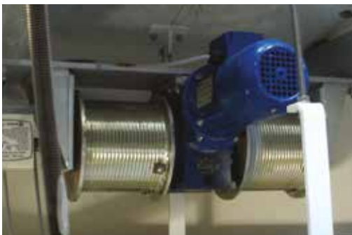
LEFT: example of a motorised winch installation

One man sited at the winch position can easily and quickly lower the light for cleaning and maintenance without the need for ladders or scaffolding.