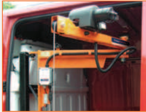
Side & rear door applications