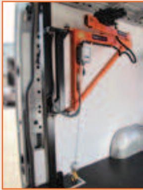
KJ250/1.5 stowed position